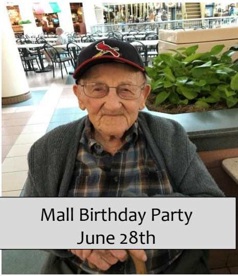
Mall Birthday Party June 28th