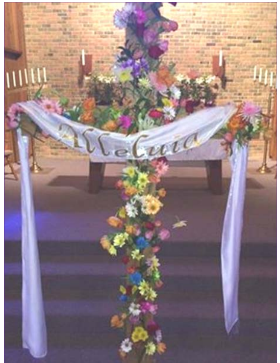
Easter Sunday service on March 27th. Beautiful!