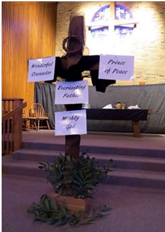
46808 Community Good Friday service on March 25th here at Grace.

And we took this "Prince of Peace" and nailed him to the cross.