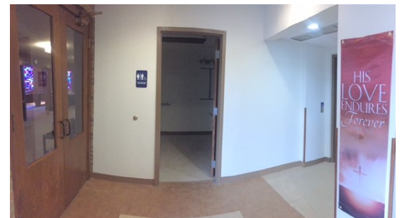
Located inside lobby of ramp entrance

We hope it has not been a major inconvenience for hanging your coats up now that construction on a new restroom is underway! In case you had not noticed, or have not been around recently, construction has begun on a new sanctuary-level restroom! Thanks to the continued generosity of those contributing to the "Improve to Move" campaign, we have been able to reach another accessibility goal set forth by the Grace Building Committee with input from the congregation. Now, this restroom allows people to use the restroom without having to go up or down a flight of stairs. Furthermore, for the convenience of the parents of little one's there is now a diaper changing station in this restroom too! We hope that many find this restroom quite useful, and invite you to check it out in the near future as construction is winding to a close. Hopefully it will be open for use by the end of the month, so stay tuned!