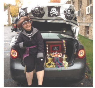
TRUNK OR TREAT 2013